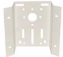
COMB6 CORNER MOUNT BRACKET