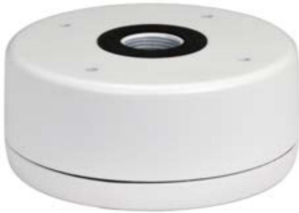
D2BASE1 JUNCTION BOX