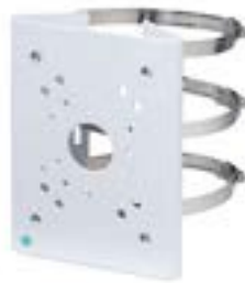
PMB6 POLE MOUNT BRACKET