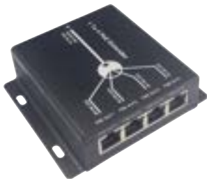
EXT-4POE EXTENDER 4 PORTS POE