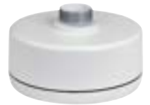
D2BASE1-G GOOSE MOUNT