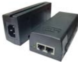
INJPOE-25W INJECTOR POE 25WATTS