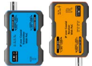
IP-COAX-300M IP OVER COAX EXT