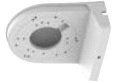
WMB2 WALL MOUNT