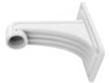
WMB6 WALL MOUNT