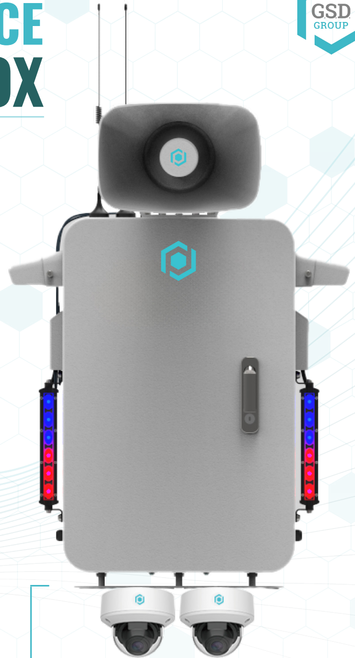
DUAL CAMERA BRACKET

Introducing the DETBOX , our supervised mobile deterrent unit - a robust security solution designed for maximum protection. This system features a powerful 12W siren, red and blue strobe lights and versatile connectivity options, including support for optional 4G/5G routers. Easy to install, with pole or wall mounting options, our mobile box offers a user-friendly interface, making it an ideal choice for a wide range of security applications, such as site supervision, dealerships, parking lots and more.